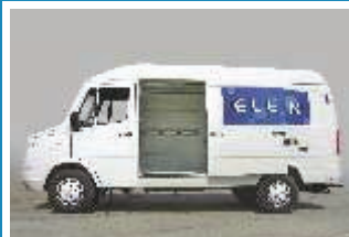
Sliding door for kerb side delivery (Optional)