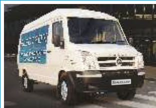
Large Branding Area