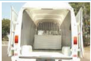
270° opening twin leaf Rear Doors for easy loading & unloading

The Traveller Variants now come with Anti-Lock braking System (ABS) with Electronic Brake-force Distribution (EBD) for best in class safety. The ABS prevents wheels from locking when braking on a slippery or winding road. The EBD ensures brake force distribution taking into account the load on each of the wheels and helps to shorten the stopping distance.